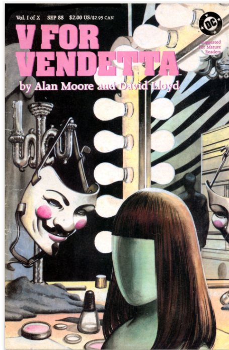
(a) original 1988 colour cover