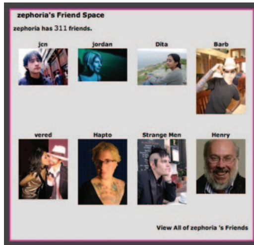
Figure 3 Example Top 8.

While teens will typically add friends and acquaintances as Friends, they will also add people because it would be socially awkward to say no to them, because they make the individual look cool, or simply because it would be interesting to read their bulletin posts. Because Friends are displayed on an individual's profile, they provide meaningful information about that person; in other words, "You are who you know." 41 For better or worse, people judge others based on their associations: group identities form around and are reinforced by the collective tastes and attitudes of those who identify with the group. Online, this cue is quite helpful in enabling people to find their bearings (see Figure 3).